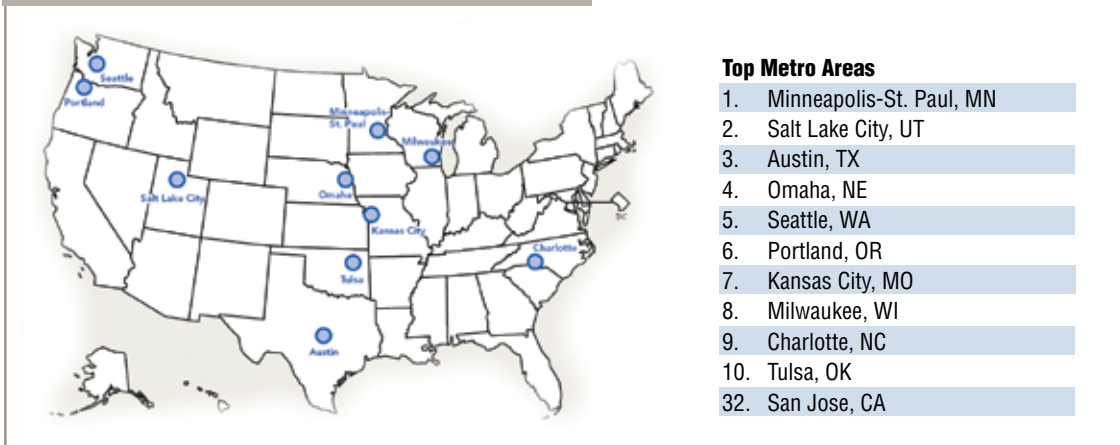
Figure 3: Volunteer Rates by Metropolitan Area, 2004-2006

Source: Volunteering in America, 2007 City Trends and Rankings. Corporation for National and Community Service.