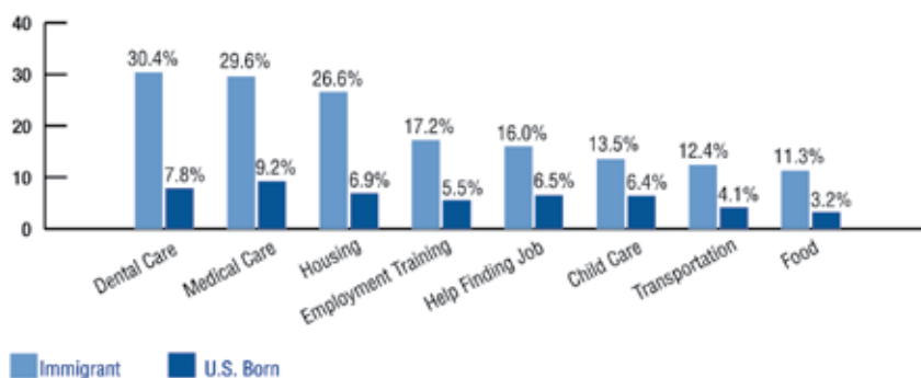
Figure 3: Percentage of Santa Clara County Immigrants versus U.S.-Born Residents Reporting Needs in Major Life Areas, 2000

Source: Santa Clara County Office of Human Relations, Citizenship and Immigration Services Program